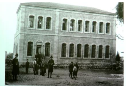
BET MIDRASH ABRABANEL LIBRARY 1892

All photos taken during visit of Voices Members at National Library of Israel to deposit 2019 Anthology, courtesy of Judith Fineberg.